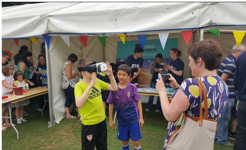
Figure 1 Smart Dublin at Dublin Maker Festival, July 2016

“Dublin is really starting to make progress on its Smart City journey however it is not without its challenges and does require high level buy in as well as strong support across Government. This will enable Dublin to deliver on its potential.”