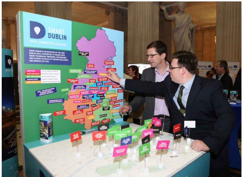
Figure 2 Smart Dublin Showcase, City Hall October 2016