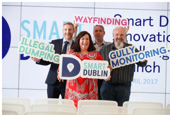
Figure 5 Small Business Innovation Research Challenges

Dublin is currently looking for smart low-cost solutions to tackle illegal dumping, to address flooding/blocked gullies and also to improve wayfinding across the Dublin region with up to €600,000 in funding for innovation contracts. The winners will be selected by an open competition process run in two phases (feasibility and prototyping) with the competition open to any organisation, tech company, or entrepreneur. www.smartdublin.ie