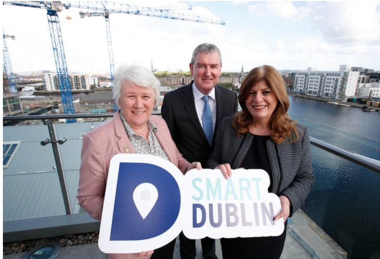
Figure 3 Smart Dublin SBIR Launch April 2017