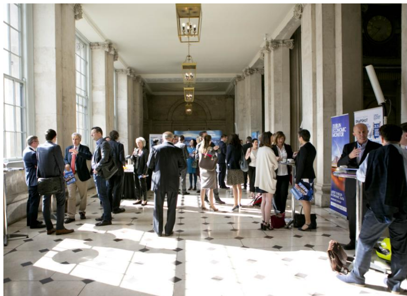
Photo 10: Infrastructure Summit mingle at a Reception in Dublin City Hall