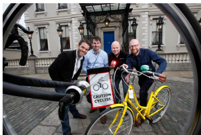
Figure 4 Smart Dublin SBIR Smart Cycle Challenge Phase 2 Launch

Following this, four of the companies are now prototyping their solutions with €25,000 each, testing out the latest innovations in IoT to track stolen bikes, to generate real time bike journey data and also to better capture the cyclist experience. A number of these companies have gone on to secure international contracts on the back of working with the city council.